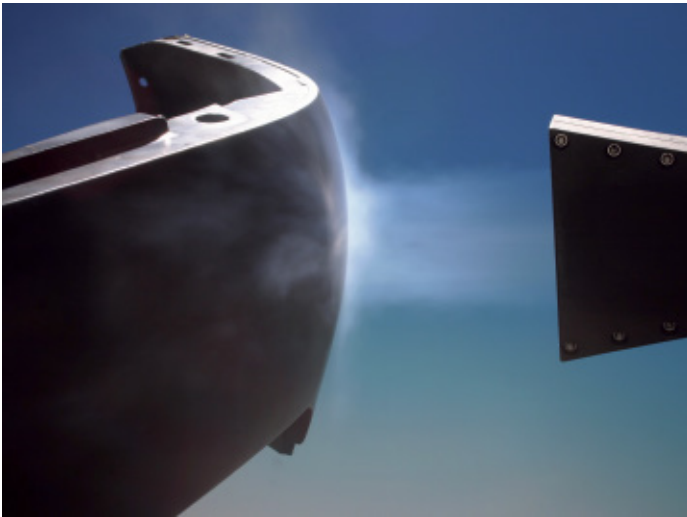
Cleaning of bumper