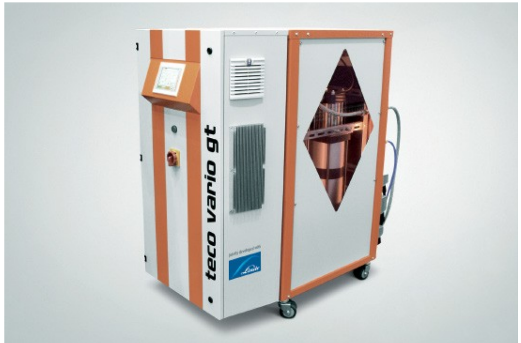
Temperature control unit for CO 2

Introduction We have many decades of experience in the development and delivery of innovative gas-enabled solutions tailored to the needs of the plastics industry. Addressing the process challenges of both injection moulding and foaming applications, our end-to-end offering extends from high-pressure supply and metering systems through cooling technologies to total gas supply solutions and supporting services. By innovating our customers' plastics processes, we help to increase capacity, improve quality and boost profitability.