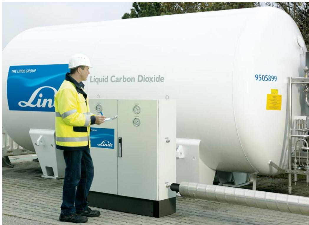
PRESUS ® C50

Multiple industrial applications require high-mass-flow liquid carbon dioxide (LIC) at constant high pressure. Customers who have two or three-shift operations often demand extremely reliable systems. Inadequate supply systems may cause bubbles in the LIC, leading to poor product quality or failures in subsequent processes. PRESUS ® C stations supply bubble-free carbon dioxide at constant controlled conditions.