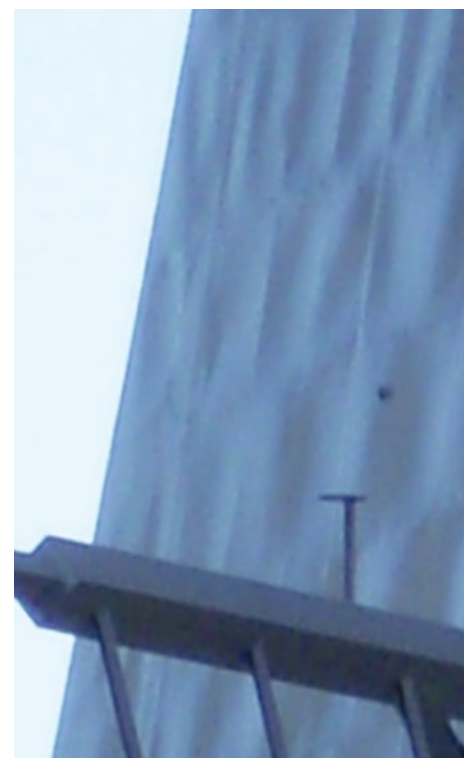
Visible distortion in a steel hull