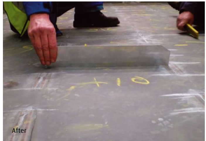
Distortions levelled after flame straightening