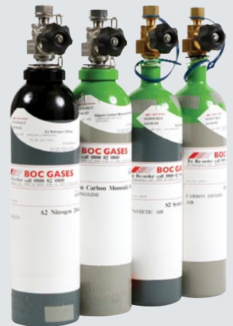
Small cylinders A2/S2