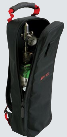
Small Cylinder Rucksack