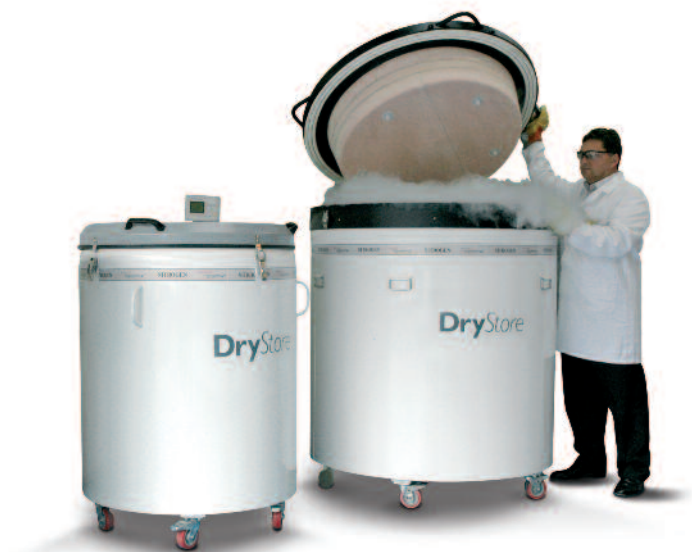
DryStore 23 (L) and DryStore 50 (R)

Fully compliant refrigerators are available featuring all the benefits of the DryStore range.