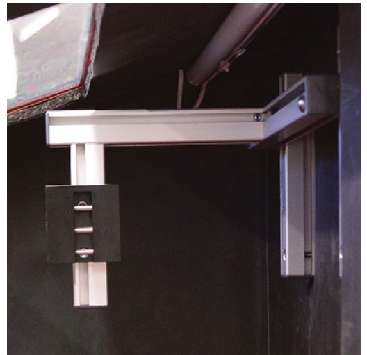
Blasting gun fixing mount