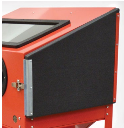
Side door for easy access