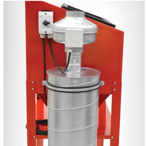
Silencer with exhaust fan