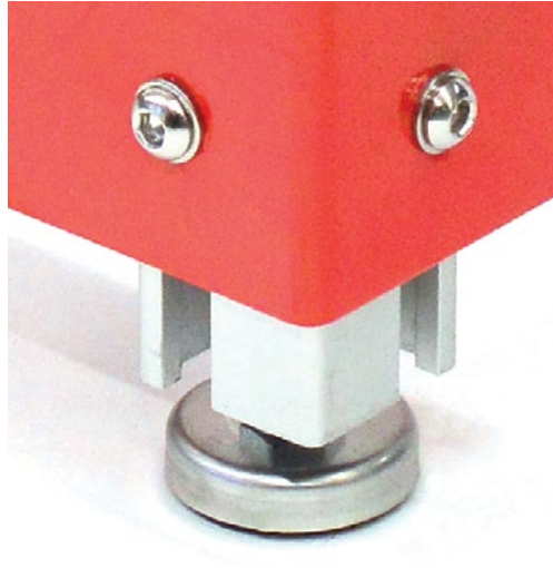
Optional mounting foot height adjustment