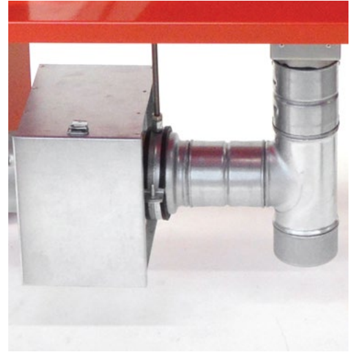
Filter and chamber for unfused metal particles