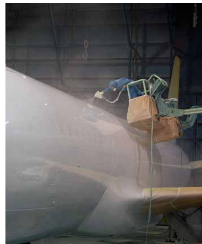
CRYOCLEAN® CO 2 snow pre-cleaning for painting and coating processes