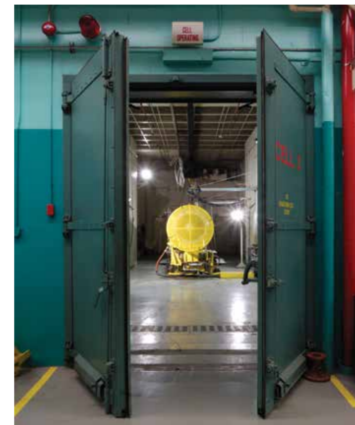
Special gases for instrument and avionics calibration and environmental testing

As part of the Linde Group, BOC has access to 20-25% of the world's commercially available helium, and manages the most diverse sourcing portfolios in the industry; ensuring security of supply and your peace of mind. Through investment in a UK helium transfill facility; BOC has more cylinders, liquid dewars, bulk tube trailers and people dedicated to its helium business than any other supplier in the UK.