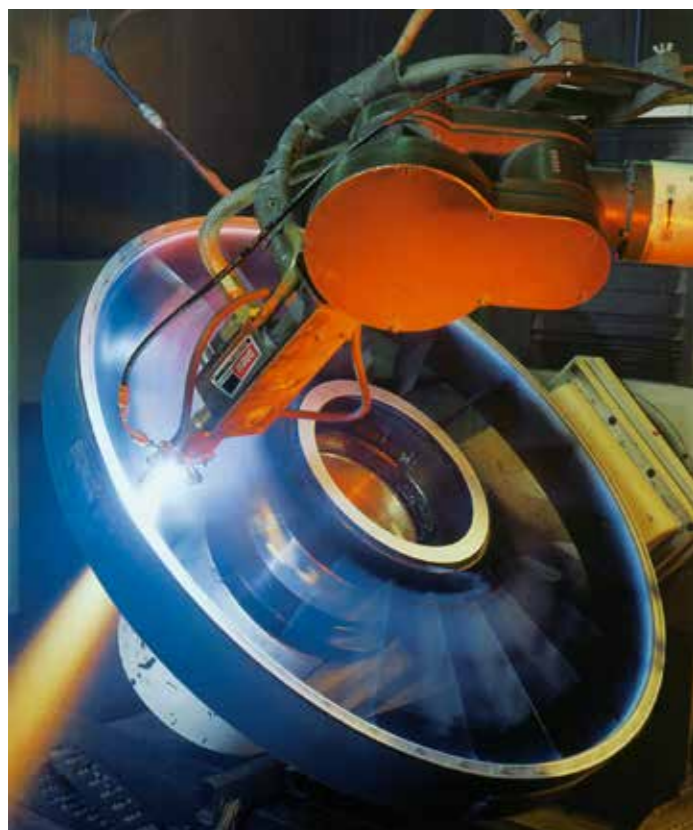
HVOF spraying process required for flight critical applications