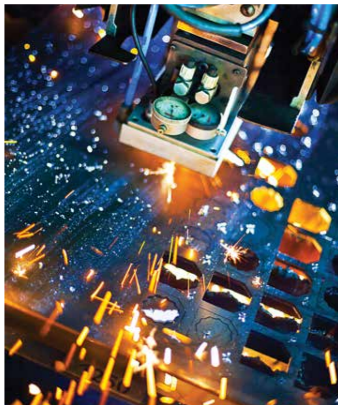
LASERLINE® gas solutions for Titanium, Aluminium and Nickel Alloy structures

For flight critical applications such as landing gears, aerospace manufacturers have traditionally utilised chrome plating. More recently the trend has been to replace with a metal powder coating; deposited by High Velocity Oxy Fuel (HVOF) spraying process in BOC supplied oxy-hydrogen, oxy-propane, oxy-propylene and oxy-acetylene gases. BOC's technological developments and expertise support manufacturers in the application of HVOF spraying through both specially shaped nozzle attachments and world class thermal spraying gases and gas mixtures.