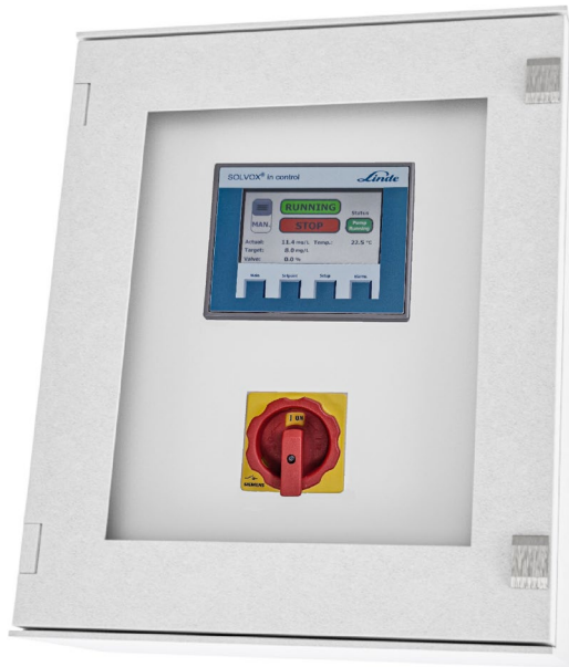
SOLVOX in control

Introduction SOLVOX in control is a specially designed injection control system for dosing oxygen to Linde's oxygenation systems, such as our SOLVOX dropin, oxycloud and venturi.